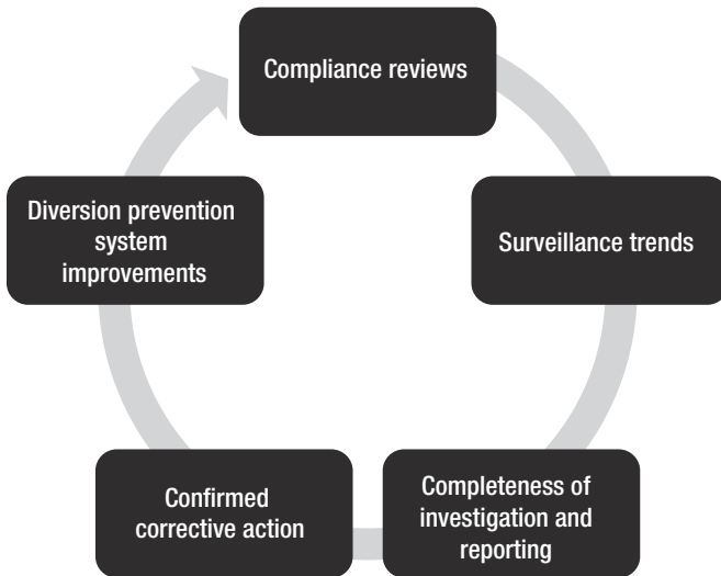
Figure 3. Monitoring and surveillance cycle.

Surveillance. Surveillance processes should be interdisciplinary and touch all aspects of the CS management system, from purchasing, inventory management, administration, waste and disposal, and documentation through expired-product management. CS auditing should be performed on a regularly scheduled basis, as determined by processes in a particular area, such as anesthesia, patient care units, special procedure areas, ambulatory care areas, and the pharmacy, focusing on identified risk points (Figure 1) and previous events. Self-audits should be conducted within areas as well as regularly scheduled audits by individuals external to the area being audited. The organization should periodically audit compliance with all diversion controls, including human resources requirements for individuals authorized to handle CS (i.e., completion of required background checks, documentation of training and competency requirements for authorized HCWs, compliance with licensure board reporting, testing for fitness for duty, random drug-testing requirements, and compliance with rehabilitation program requirements). Important examples of recommended surveillance practices include the following (See Appendix B for additional guidance.):